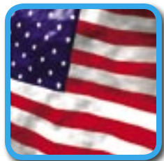
USA 2p a minute