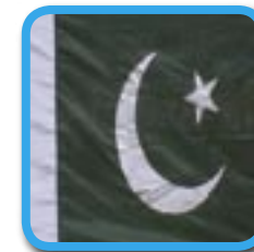
Pakistan 12p a minute