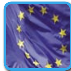
EU Nations from 2p a minute