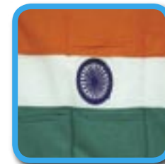
India 12p a minute