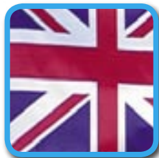
UK 2p a minute