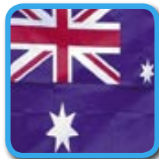
Australia 2p a minute